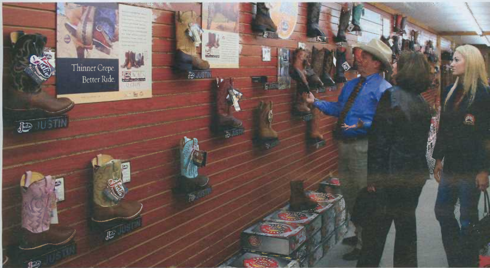
Each Justin Brands' division gets its own wall space, which is decorated with posters supplied by the company.